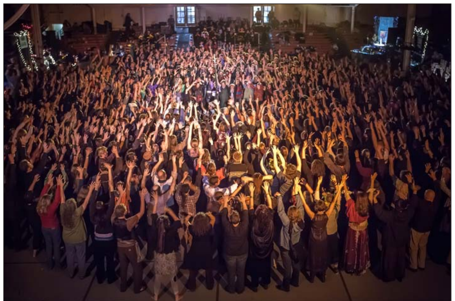
In a striking display of the magical power of the annual Spiral Dance ritual, hundreds of participants simultaneously volunteer for the clean-up crew.

Reclaiming's BIRCH council has announced that due to health concerns the Witchcamp Rugby League will postpone its championship match. Witchlets' Fighting Faeries were favored to take the Crystal Cup over Spanish Winter Camp's Brujas Grandes.