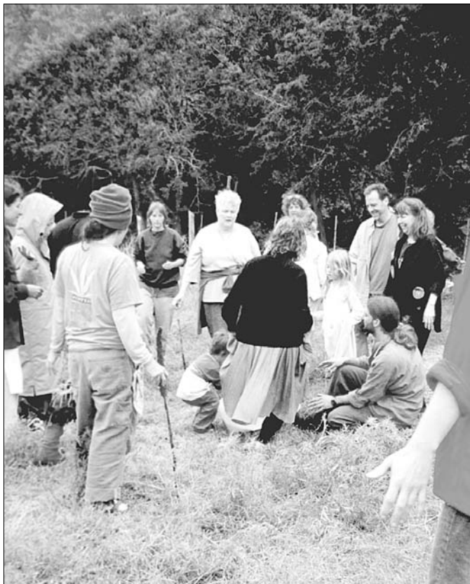
Photograph from the first Dandelion Gathering, 2004

For more info on this and future Dandelion Gatherings, visit dandeliongathering.org