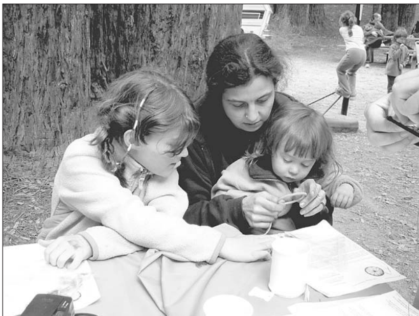
Witchlets in the Woods offers magic for kids, teens, and adults.

Contact specific camps to find out their focus, age range, and other details. For info on organizing a camp in your area, contact RQ.